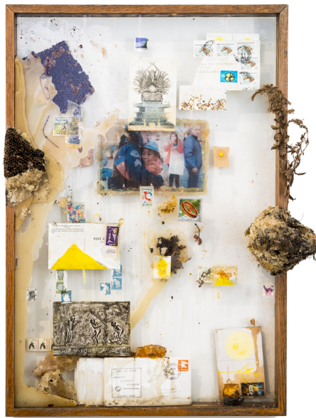
Terence Koh, Bee Chapel .

Who I Am presents a selection of rediscovered black-and-white studio portraits which capture the challenges of social acceptance, ethnicity and gender roles during South Africa's apartheid. Photographer Singarum Jeevaruthnam Moodley captured the images between 1972 and 1984 in Pietermaritzburg, the capital of KwaZulu-Nat