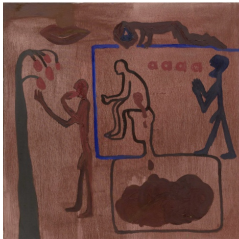
A.R. Penck at Michael Werner Gallery, New York.

The show examines the influence of the Italian master's art on the practices of the next generation of artists.