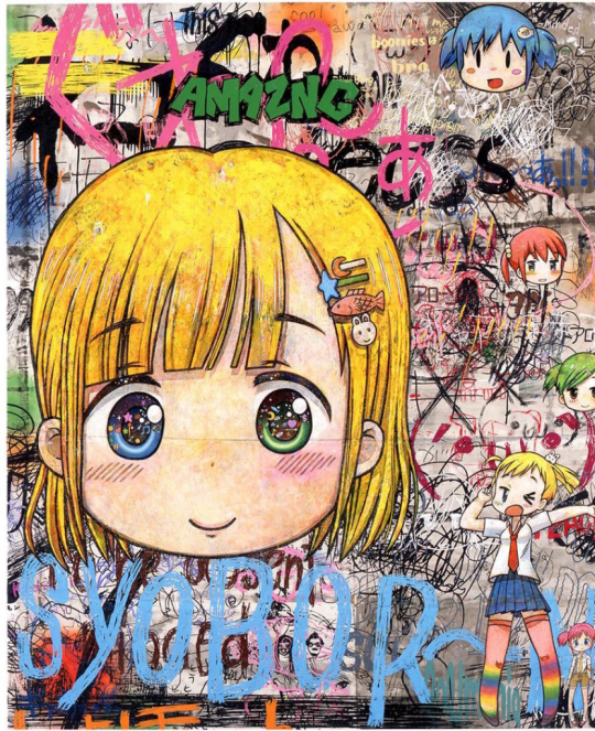
MR. Whaaaaaat!? Whyyyyyyy!? (2015).