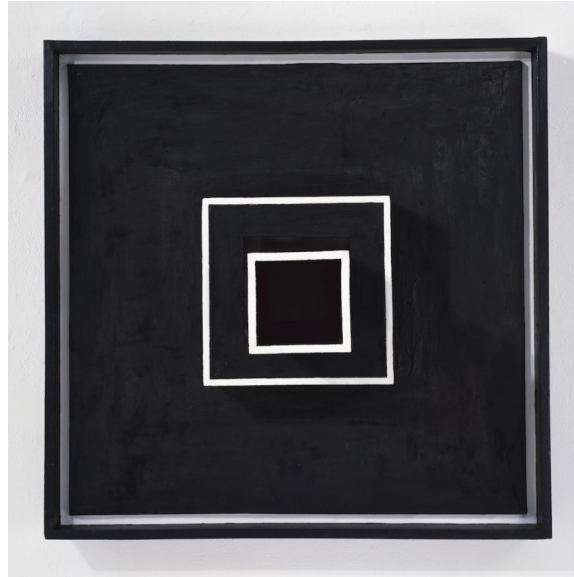
Sol Lewitt Abstract Painting (1965).