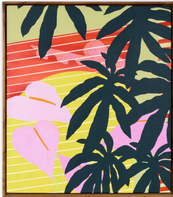
Billy Al Bengston Kahea (1984).

When the art world enters a temporary lull this summer, a number of New York's galleries and museums will bare their more experimental side. The result is some of the most eclectic and charming exhibitions of the year. Young artists are introduced to the scene in group shows and unusual left-field works are shown without fear of market reprieve.