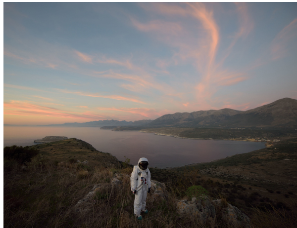
John Akomfrah at Lisson Gallery.

The Arte Povera-inspired Japanese artist is back in New York with a new show at the Chelsea gallery, which is featuring new works inspired by manga and anime subculture.