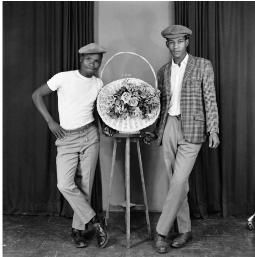
S. J. Moodley, [Two men with floral decoration] (ca. 1978). Photo: courtesy The Walther Collection.