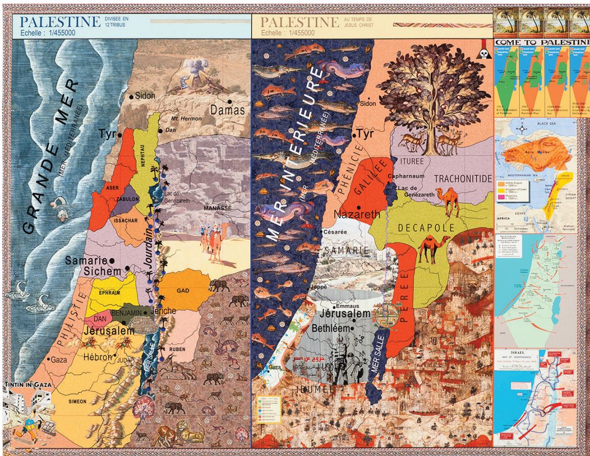
Joyce Kozloff, "Social Studies: Palestine" (2013), collage, digital archival inkjet print, 36 x 47 in (© Joyce Kozloff, courtesy the artist and DC Moore Gallery)

content to the prints with paint and collage. Colorful, commanding, and detailed, the resulting maps tell histories not taught in classrooms, offering information about elections, history, native populations, natural resources, and war. For instance, "L'Afrique" has an insert map of the Scramble for Africa, which delineates the territories in Africa colonized by the French and British between 1880 and 1914, plus another outlining the "trends and levels of stunting" throughout the continent. In "Palestine," Kozloff divided the composition into a series of maps showing the loss of Palestinian land to the Israelis since the 1947 UN Partition Plan, the Israel War of Independence, and the movements of Palestinian Refugees, among others. Via her carefully chosen yet condemning content, Kozloff deflates the apolitical national mythologies portrayed in the original maps.