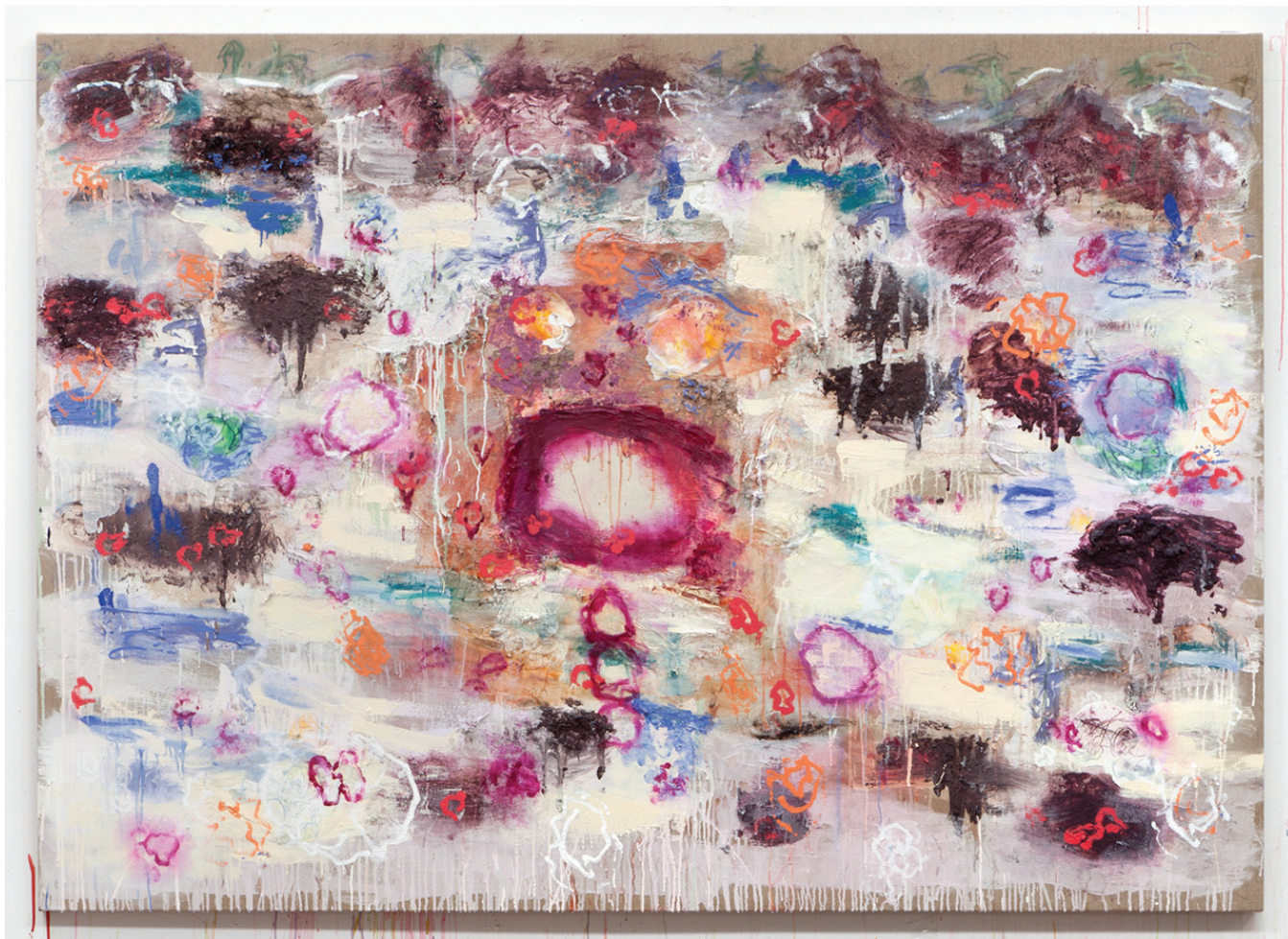
Joan Snyder, "Lay of the Land" (2014), oil, acrylic, dirt, paper, pastel on linen, 60 x 84 in

resulting in a three-dimensional impastoed surface that begs to be touched, and that features the word "requiem" (twice) in red paint and glitter; the latter features an all-over composition with lusciously applied pastel-colored paint in big, sweeping gestures, combined with repetitive circular and floral forms.