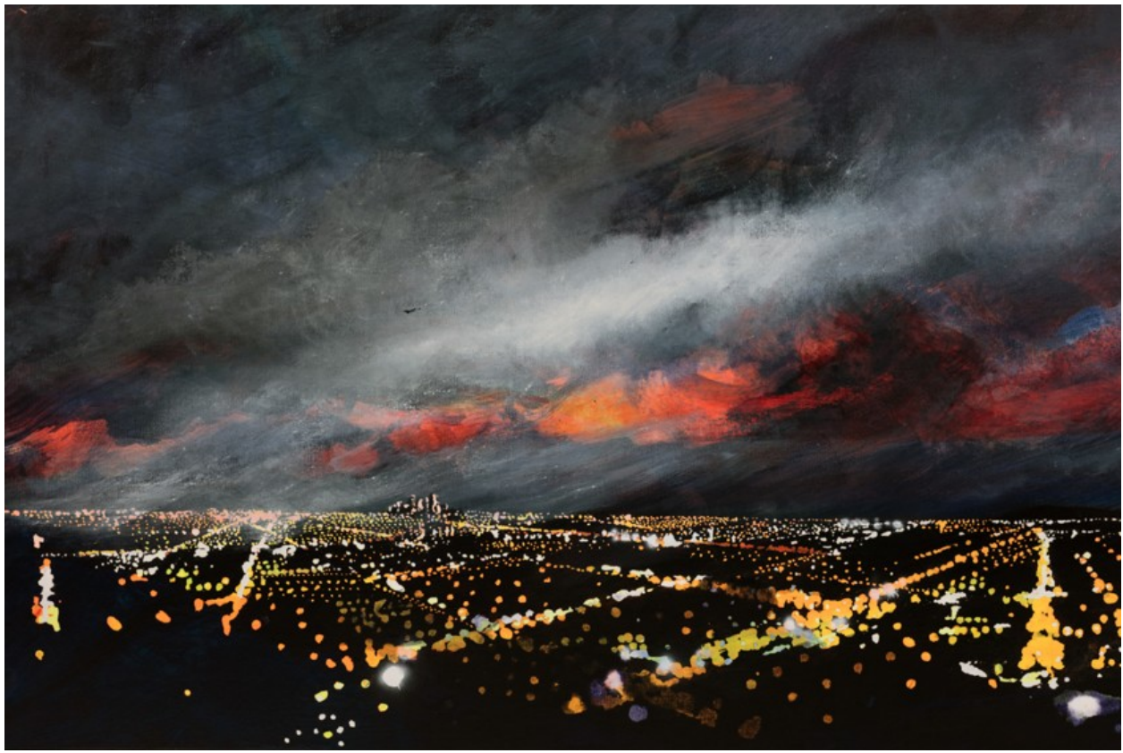
Peter Alexander, "Thrasher," 1992. Oil on canvas. (UCI Institute and Museum for California Art)

"I kept seeing these incredible sunsets," he said. "I really wanted to make a picture - a real, dumb picture."