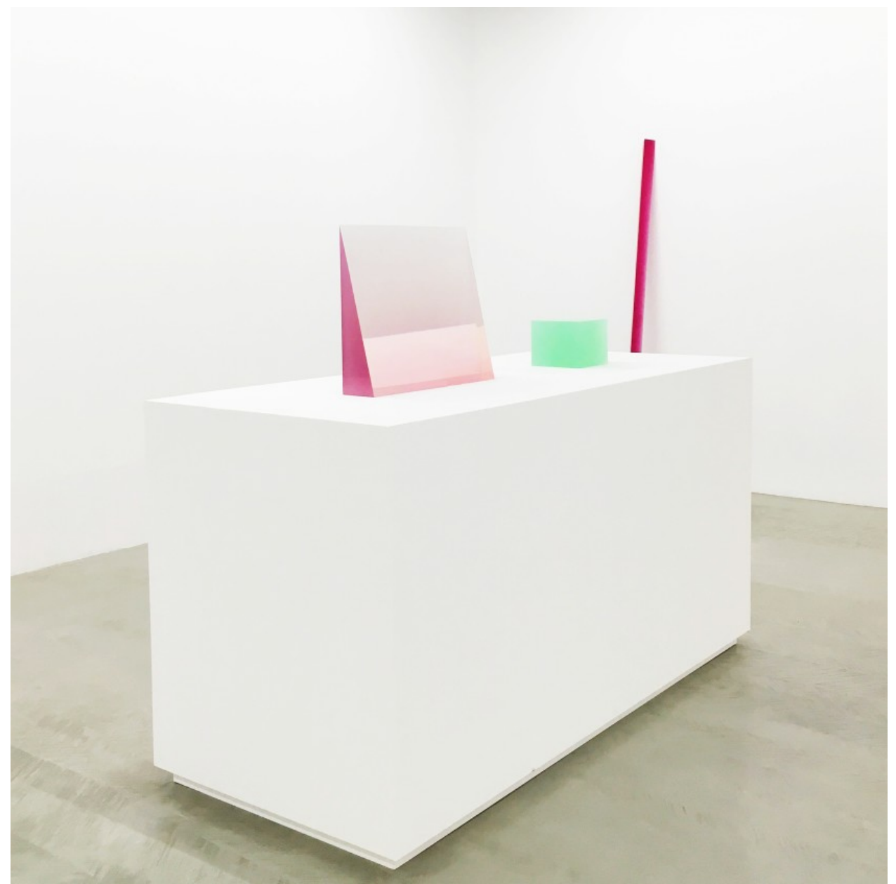
An installation view of sculptures by Peter Alexander at Parrasch Heijnen Gallery in 2016.

"To use Louis Kahn's phrase, 'What does the building want to be?' What does the object want to be? What does the material want to be?"