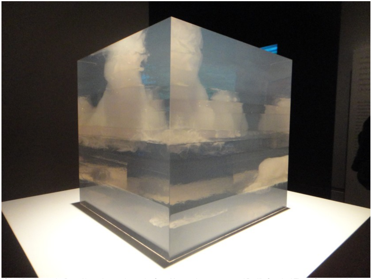
"Cloud Box," 1966, by Peter Alexander, on view at the Getty Museum in 2011 as part of Pacific Standard Time.

Those experiments with industrial materials, begun when he was a student at UCLA, led to the creation of ethereal sculptures that evoked the quietly shifting nature of light, color and environment. And they put Alexander among the vanguard of Southern California's Light and Space artists, a movement that brought buoyancy and perceptual play to Minimalism, which until then had been dominated by the more austere forms emerging from the East Coast.