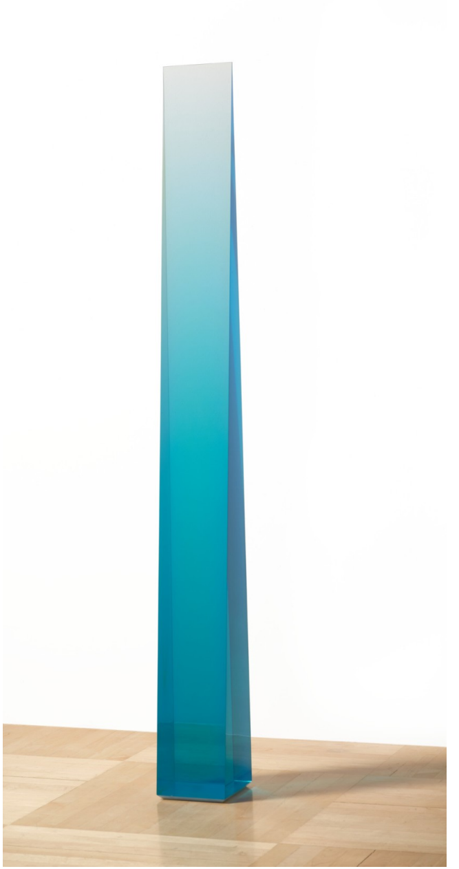
"Untitled," 1968, by Peter Alexander – one of the artist's wedge sculptures, in the collection of the Los Angeles County Museum of Art.

confirmed by representatives at <u>Parrasch Heijnen Gallery</u>, his long-time art dealers. The cause was undisclosed but said to be unrelated to COVID-19.