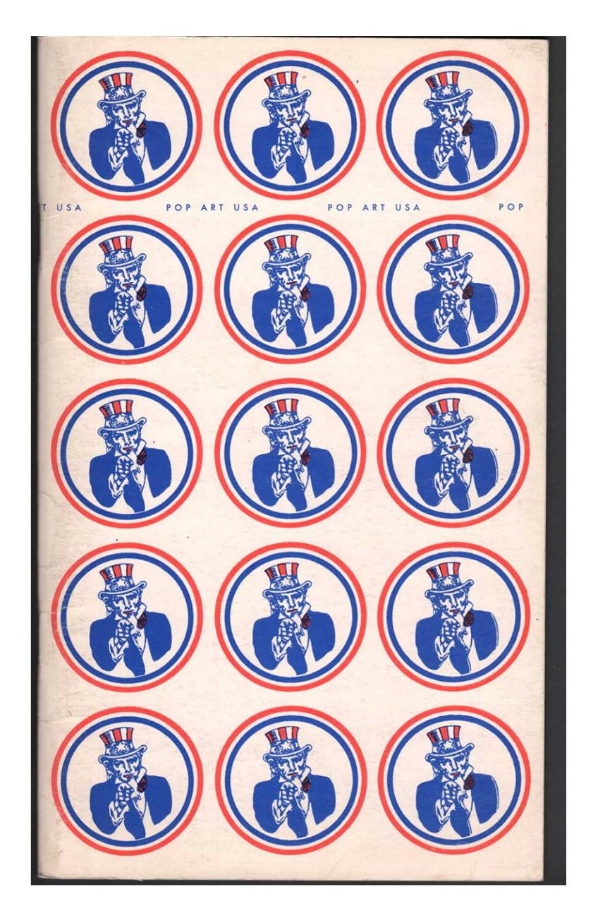
1963 Cover of Pop Art USA at Oakland Museum, curated by John Coplans; Book cover design by Tony DeLap