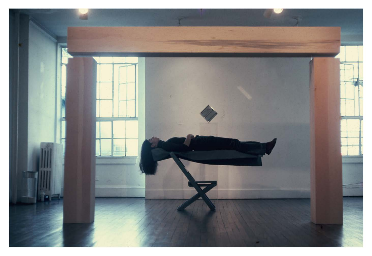
Floating Lady III, 1972, Robert Elkon Gallery