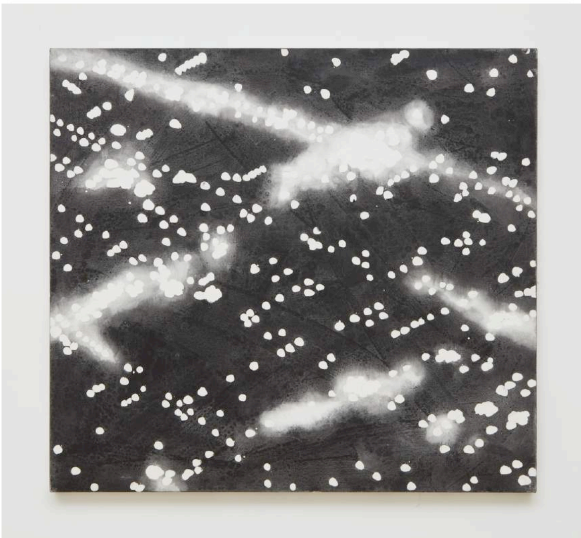
Peter Alexander Menlo, 1990 Acrylic on canvas 30×33 inches