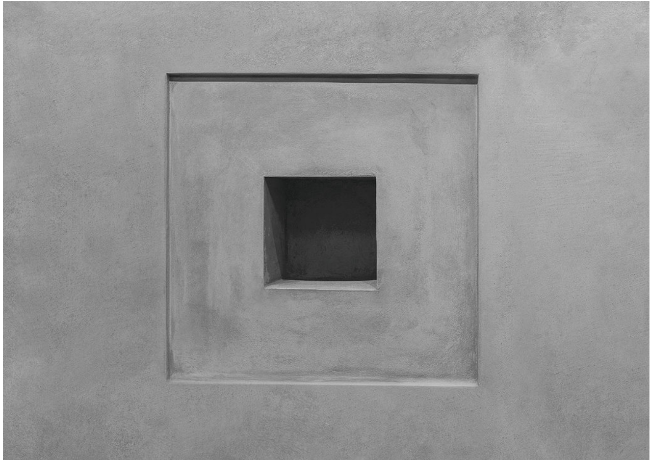
A compartment in Moscow’s Garage Museum of Contemporary Art reserved for Taryn Simon’s “Black Square XVII,” which is expected to be completed in 3015. “Black Square,” 2006–, Void for artwork, Permanent installation at Garage Museum of Contemporary Art, Moscow

fairly practical terms. “I consider it an adventure in geometry and astronomy, bumping into the spiritual,” he says. “It still unfolds every day for me.”