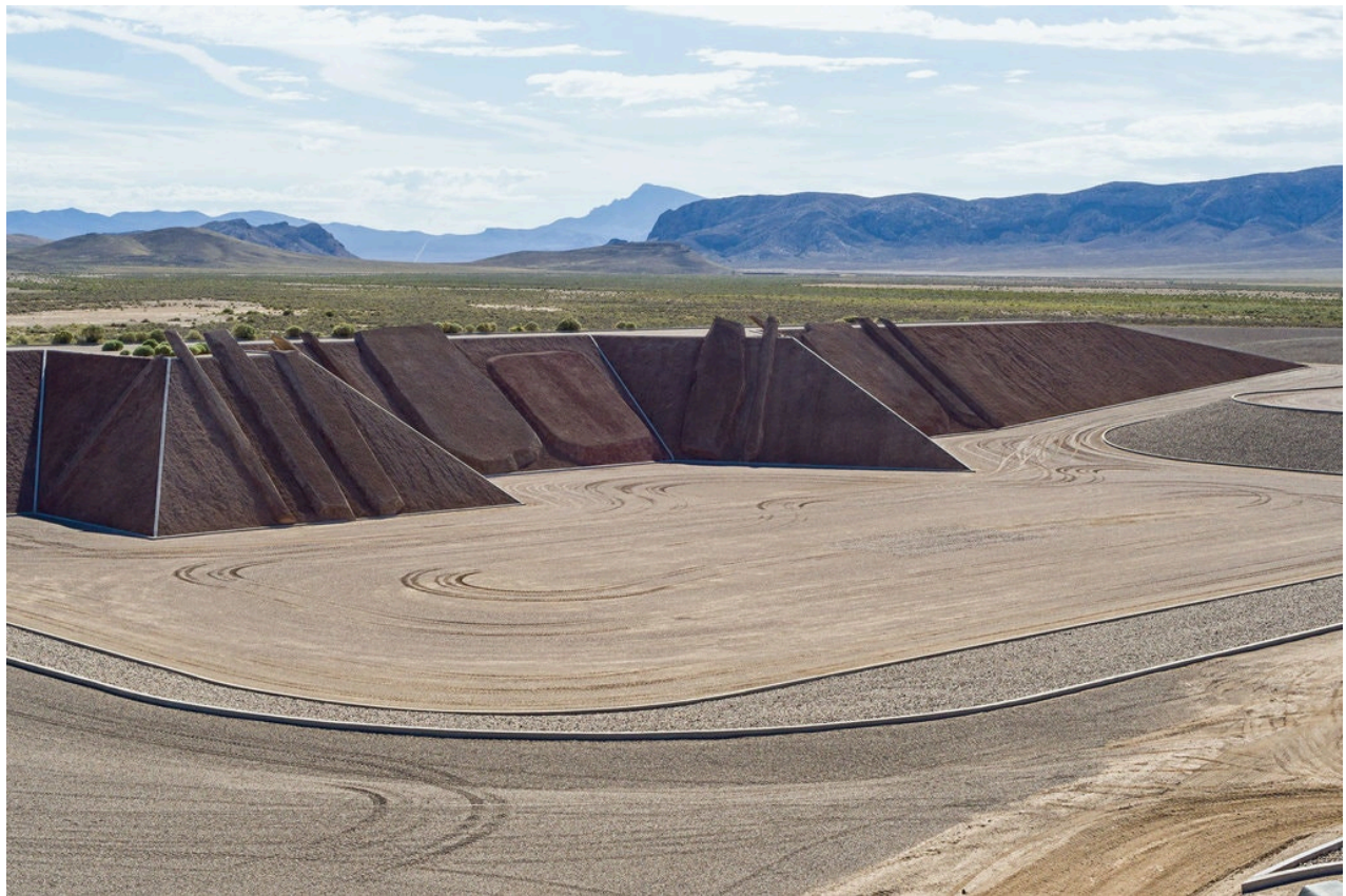
Michael Heizer’s “City” has been a work in progress since the 1970s. “Complex Two, City,” 1970-Present © Michael Heizer/Triple Aught Foundation 2018. Courtesy of the artist and Gagosian Gallery. Photograph: Eric Piasecki

return these emotions. Certain artists build the concept of a long gestation period into the work itself: “ Black Square XVII ,” an installation by Taryn Simon at the Garage Museum of Contemporary Art in Moscow, is currently an empty shelf in the museum, reserved for a chunk of vitrified nuclear waste once its radioactive properties have diminished to a level safe for human exposure — about 1,000 years from now, in 3015.