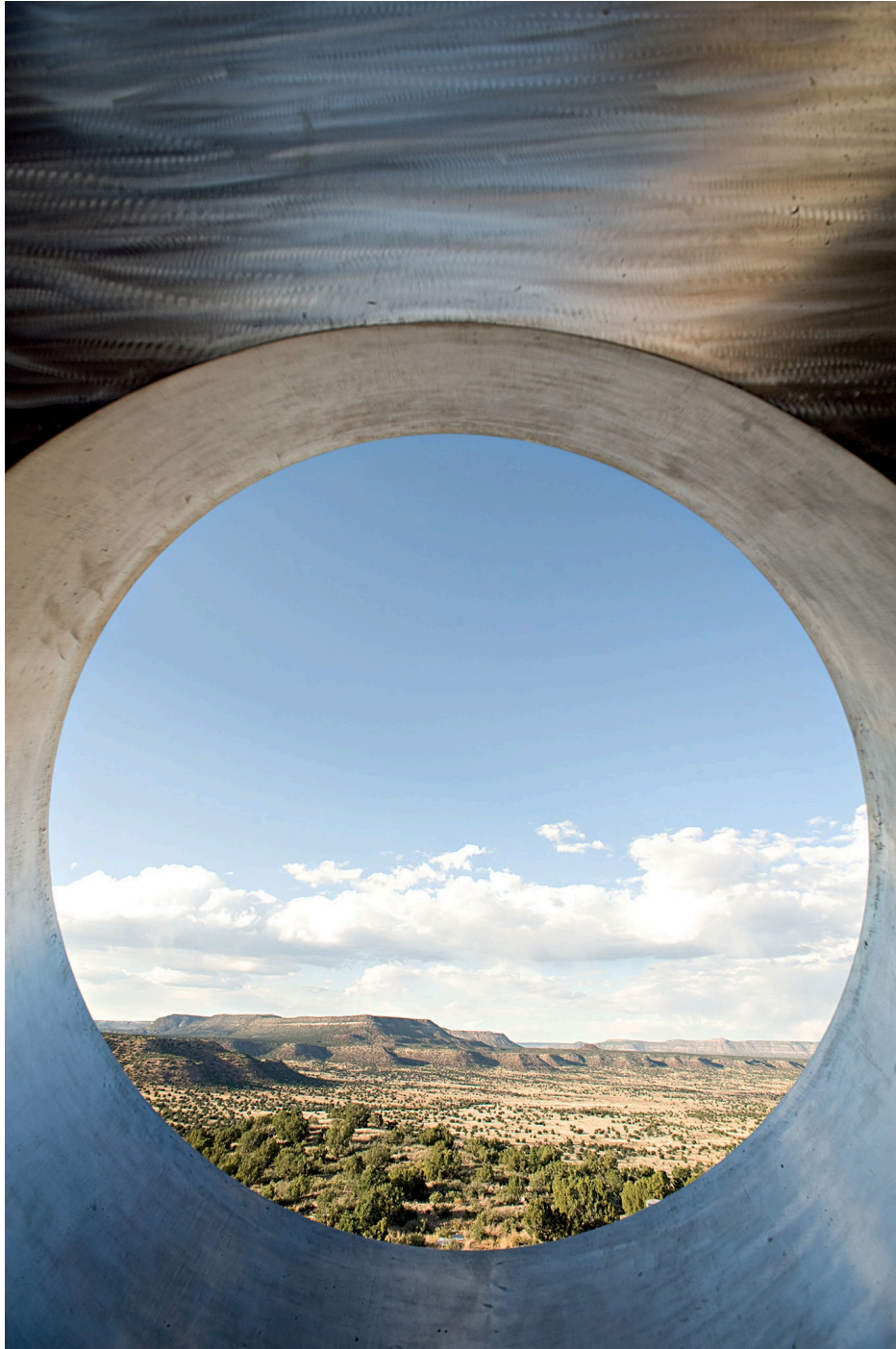
The view of the desert in New Mexico from Charles Ross's "Star Axis" (1971-still under construction), a land art sculpture that the artist has been working on for several decades. © Charles Ross 2018

But the 17-year slog to realize the work the artist calls "The First Plane" is still ongoing. There have been endless prototypes, numerous engineering studies, countless rounds of fund-raising. Scheduling at the Deichtorhallen, where the work was originally to be shown in February, has